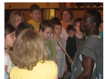
Saakumu drummer talking with Poston Road (Martinsville) Elem. Students.