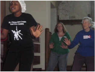
Teachers learning Ghanaian dance during Spring Workshop.