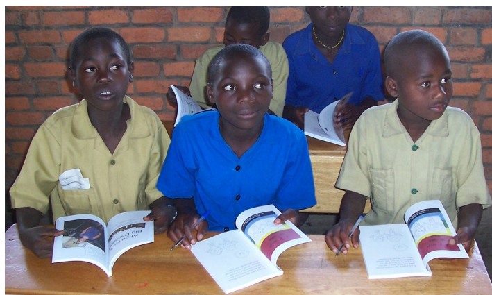
Kabwende students with new copies of The World is Our Home

Kabwende Primary School has 2000 students, ages 5-17 years, with only limited resources. During the coming year, Kabwende students will create their own books and sent them to the United States where they