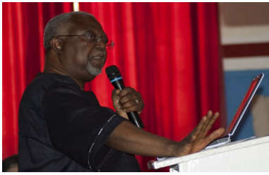
Amos Sawyer, IU Workshop in Political Theory and Policy Analysis