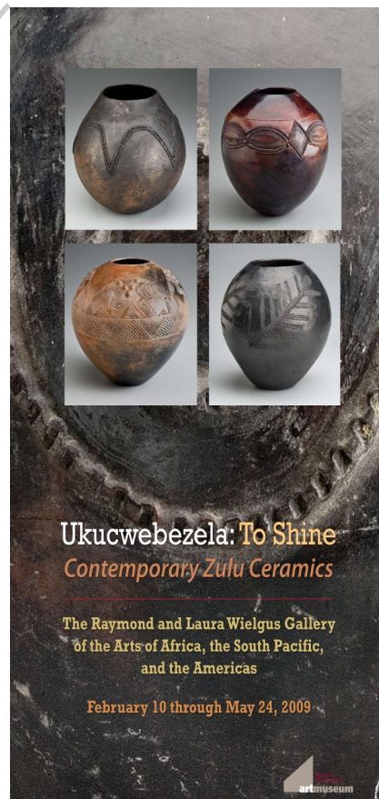
IU Students learn about Zulu ceramics