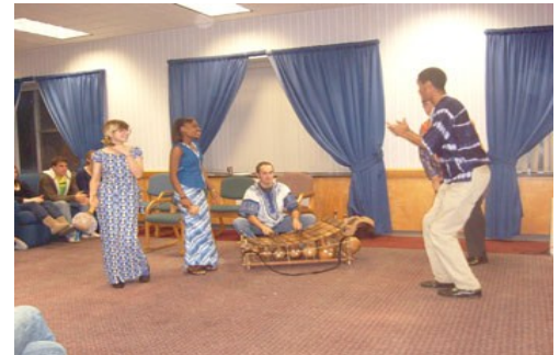
Akan students dance to the gyil.