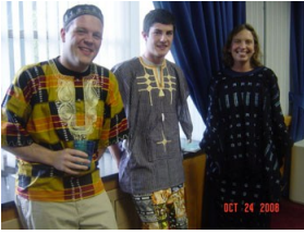
Bamana students enjoying the festivities