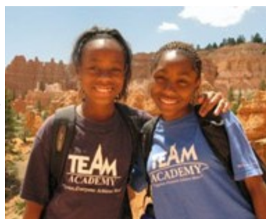
Newark Collegiate students take a moment to enjoy Rwanda's natural beauty

The trip culminated a unique year-long collaboration that involved twenty-five students from IU's Global Village, a residence hall focused on language learning and global awareness, and sixteen high school students from Newark Collegiate Academy, a member of the TEAM Charter Schools in Newark, NJ. Together they researched, developed, and illustrated the short stories that were