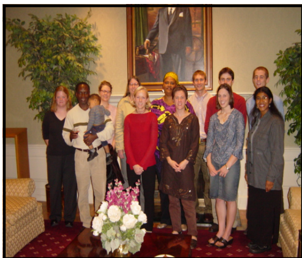
Academic Year FLAS recipients at the 2003 Fall reception